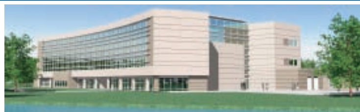
SCC's future Center for Economic Development at Heathrow

For more information about SCC's Center for Economic Development at Heathrow visit www.scc-fl.edu/ced .